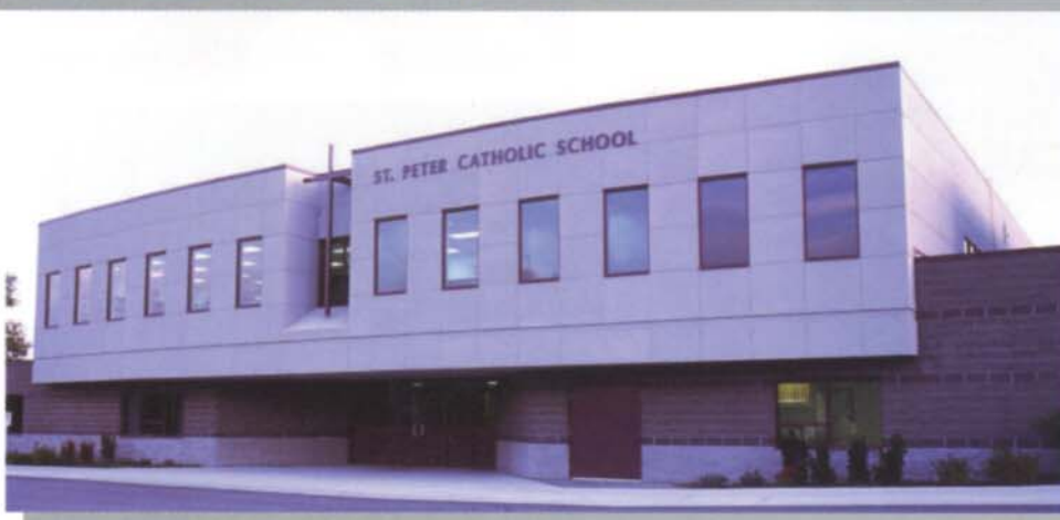
ST. PETERS CATHOLIC SCHOOL WESTWOOD & WILLOW RD. GUELPH, ONT.