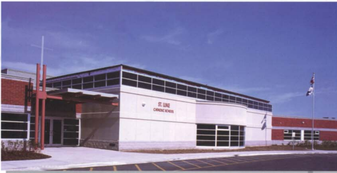
ST. LUKE CATHOLIC SCHOOL 550 CHESAPEAKE DRIVE WATERLOO, ONT.