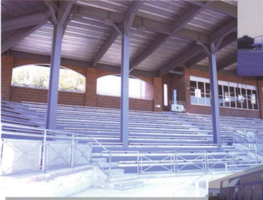
LABATT'S MEMORIAL GRANDSTAND LONDON, ONT.