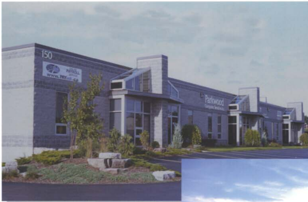
COMMERCIAL PLAZA 160 PINEBUSH RD CAMBRIDGE, ONT.